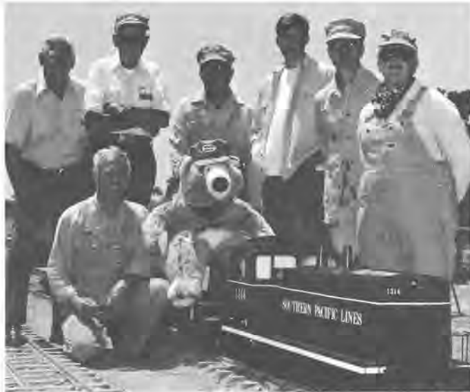
Crew members pose with new engine and friend.

The Museum's operating replica was manufactured by Morris Industries of Charlotte, Michigan. Research and