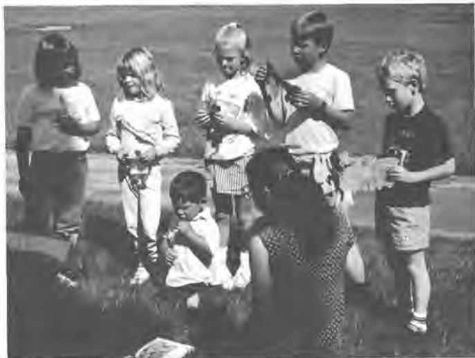
Children on Simi Trip act out "Little Engine."

The Museum joined in the Summer Reading Program of the Santa Barbara public libraries. This year's theme was "Get On The Right Track — Read." Our involvement included several activities. To encourage reading achievement, we