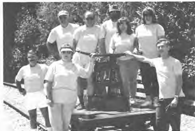
Handcar team takes a well-deserved bow.

Congratulations to all participants for their fine showing!