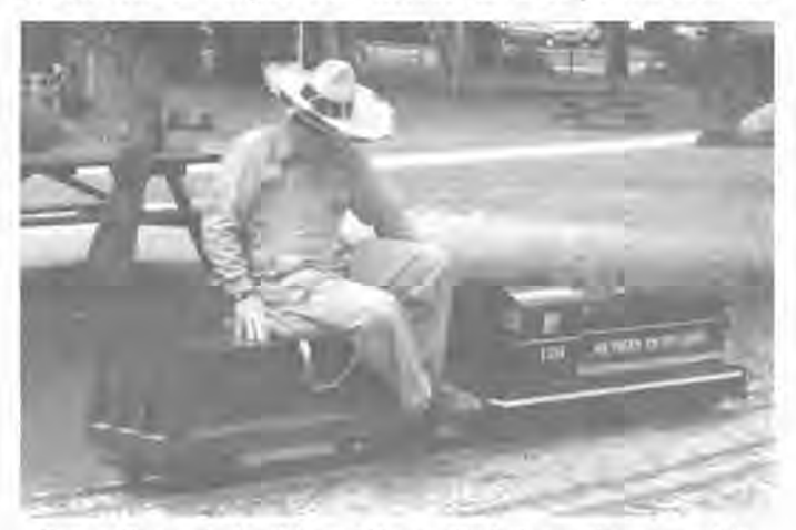
Señor Cogan helped keep "Fiesta Train" running smoothly.

The railroad museum got an extra publicity bonus when Goleta Depot was chosen as this year's site for