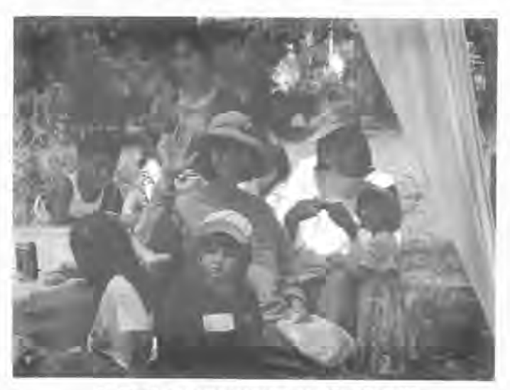
Jr. Engineers party was great fun for all!

The second annual Junior Engineers Club Party was held Friday, July 15. There were about 47 in attendance, including 19 Junior Engineers, plus their guests