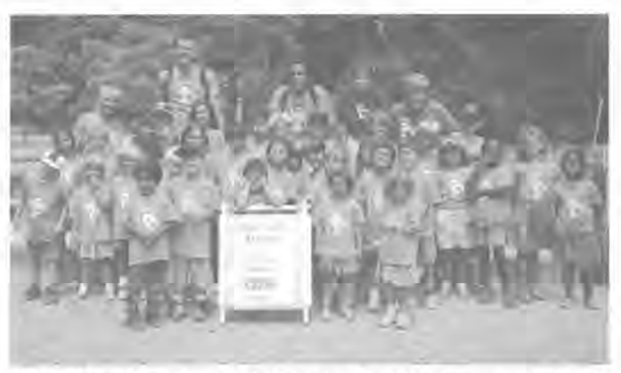
Cliff Drive Care Center kids enjoy Cox Cable-sponsored visit,

Children who tour the historic Goleta Depot with their school class or youth organization will again be able to take a free ride on the Goleta Short Line, compliments of Cox Cable Santa Barbara. Cox Cable recently renewed for a second year its support of the