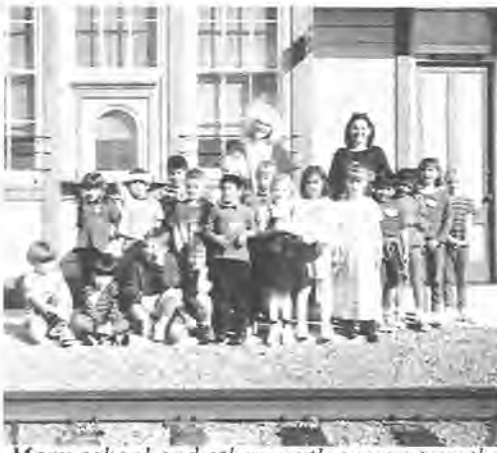
Many school and other youth groups tour the museum and historical landmark each year.

The event drew more than 100 representatives from railway museums and other railwaypreservation organizations from throughout the U.S. and Canada.