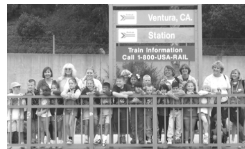
Proud travelers pose for photos at their destination.

The museum's program of railroad field trips for local children, which has been on hold for several years, came to life on May