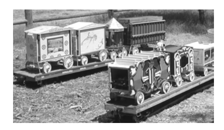
Circus cars were everywhere!

wisser's 0-6-0 switch-engine, and Bill Hoey's 2-6-0 mogul. Volunteers who helped with the train-ride included Joel Bingham,