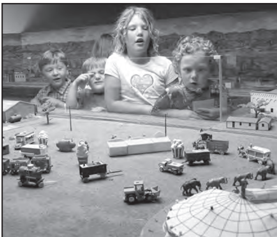
The circus display in the model-railroad room is a Steaming Summer favorite.

Daily admission to Steaming (cont'd. on pg. 4, “ Steaming Summer ”)