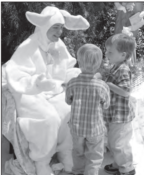
A visit with the Easter Bunny was a favorite stop for our young guests.

For safety, all riders must meet the 34-inch minimum-height requirement.