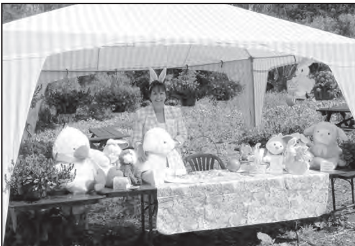
Peggy Langle shows off some of the drawing prizes.