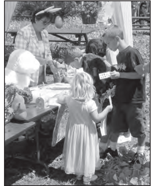
Young and old scrambled to the event's many "station stops."