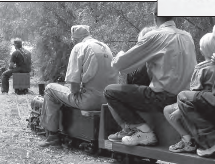
A crowded meet at Milepost 10.