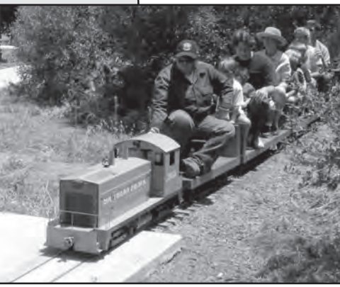
the circus train.