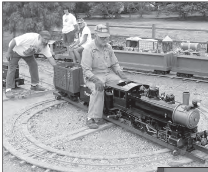
Putting everything on the table.