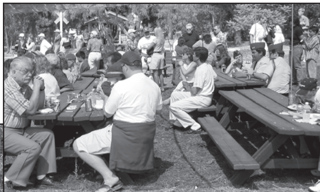
The switching puzzle was a popular addition.

A long list of other friends, businesses and organizations donated or loaned equipment, supplies and auction items for Depot Day .