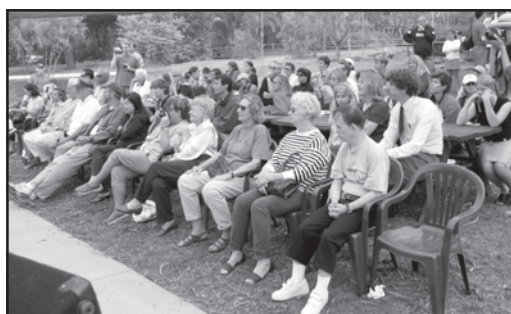
The Monte Vista School chorus (left) performed before an appreciative audience.