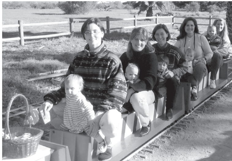
These little ones and their proud moms enjoyed the fun last Dec. 10.

In the interest of safety, the museum's 34-inch minimum-height requirement applies for all Candy Cane Train riders.