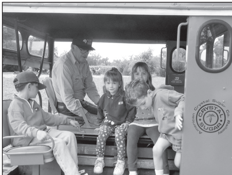
Inspection car rides are only offered on Depot Day.

The auction is a very important source of financial support for the museum. Please help by visiting the tables