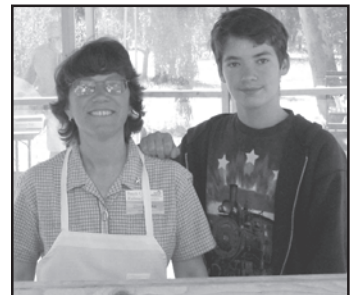
Scenes Of Summer (Steaming)