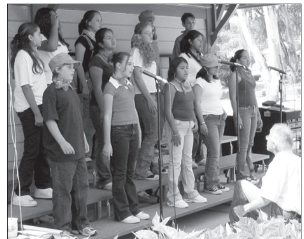
The singers from La Cumbre Junior High School made their first museum appearance on Depot Day.