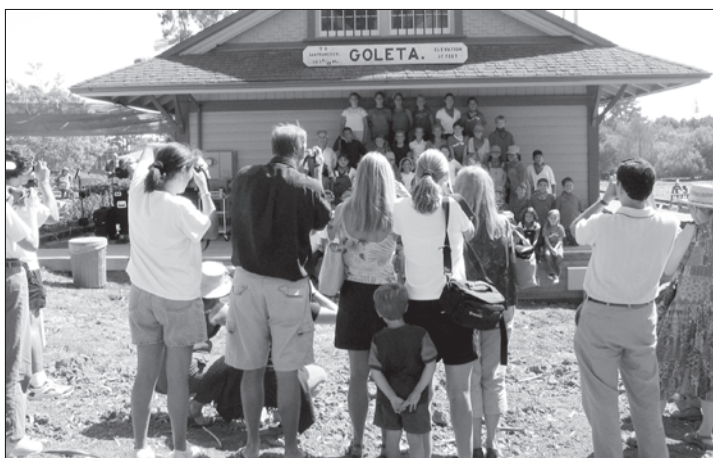
The paparazzi couldn’t get enough of the Monte Vista Elementary School chorus.