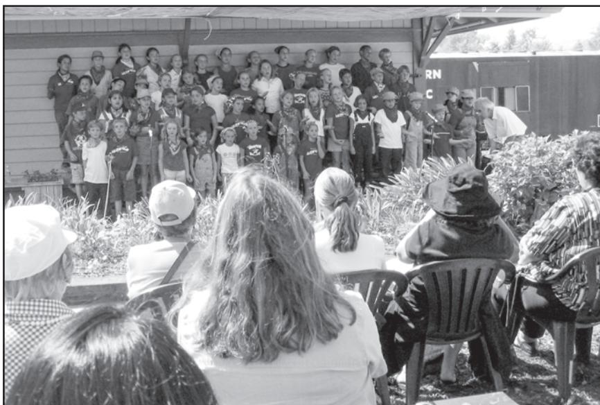
Youthful singers are a Depot Day mainstay.

The auction is a primary source of finan- (continued on page 2)