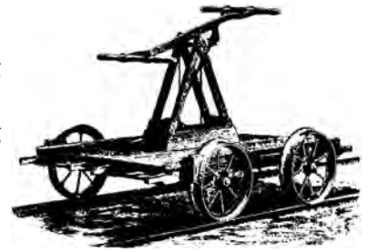
A New Home: November, 1981

Please support this important museum event by making a tax-deductible donation using the pledge form that accompanies this newsletter. For more information about the event and how you can help, please contact the museum office at 964-3540 or museum@goletadepot.org .