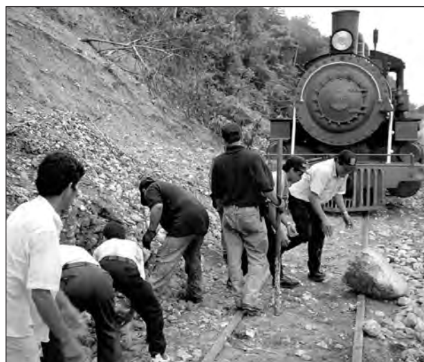
Crew clears a rock slide on the Ferrovias Guatemala.

(continued on page 4, See "Thom To Talk")