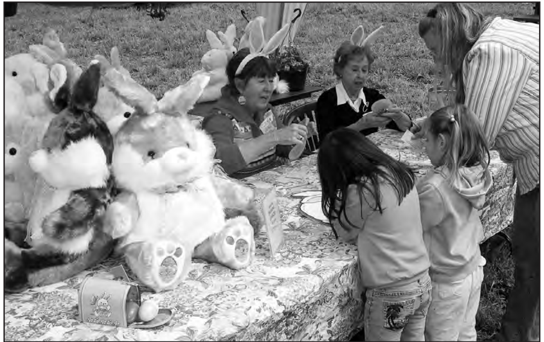
At left, a mountain of stuffed bunnies await lucky winners of the Jack Rabbit Junction drawing during a recent Easter Bunny Express. Behind the table, volunteers Judy Blue and Claudia Worthen help event attendees prepare their drawing entries.

The 16th annual Easter Bunny Express comes to the museum grounds on Saturday, March 22. Regarded by many as the most enchanting event on the museum calendar, the Easter Bunny Express treats attendees to a number of fun activities, each of which is listed as a “station” on the special super-sized, egg-shaped ticket. These include visits to Wabbit-Twacks Station (to ride the decorated trains on the newly expanded half-mile-long track!); Harvey’s House (for a delicious cookie and lemonade); Easter-Bunnyville (to meet the Easter Bunny, where children will also receive an egg surprise); Jack-Rabbit Junction (to enter a prize drawing); and What’s Up