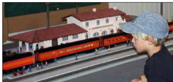
There were model trains running everywhere!

The committee has already chosen the weekend of July 24-25, 2010 for a second annual Goleta Railroad Days .