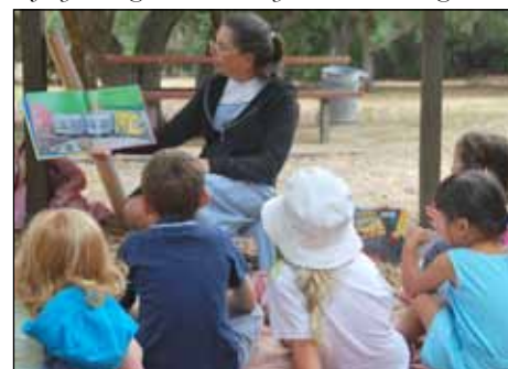
Goleta RR Days