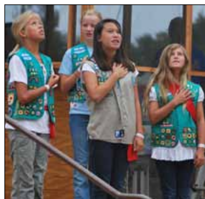
Saturday morning flag-raising & pledge.

good help from museum members and friends in response to articles in previous issues of the Depot Dispatch newsletter, especially in terms of personal photographs. These include historical images as well as more recent snapshots, like the two examples shown here.