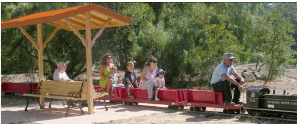
Westside Station will be the terminus for one of two Depot Day train rides.