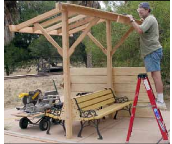
Noel Langle adds a board to the new station roof.

Because of the hard work and perseverance of Seth Olitzky , visitors riding the Goleta Short Line, as well as those waiting for trains to pass, are now treated to the bell and lights of the crossing signal every day that the ride runs, weekdays and weekends alike. ( http://rrmuseum.smugmug.com/Projects/GSL/Crossing/ )