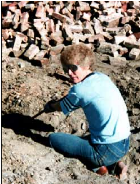
Excavating depot bricks, Nov. 19, 1981.