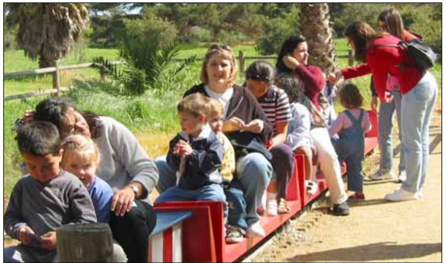
Eager families board the Candy Cane Train for another holiday-season run.

The South Coast Railroad Museum's much-anticipated year-end event, the Candy Cane Train , pulls out of the station the day after Thanksgiving, Friday, Nov. 27, to begin another holiday-season run. The Candy Cane Train continues daily through Dec. 24 (except on Nov. 30 and Dec. 1, 7-8, 14-15, when the museum will be closed). During Christmas week, the museum will be open two extra days — Monday & Tuesday, Dec. 21-22 — so that