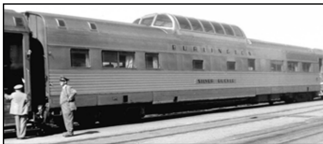
Silver Splendor historically (left), as Silver Buckle , and today (above).