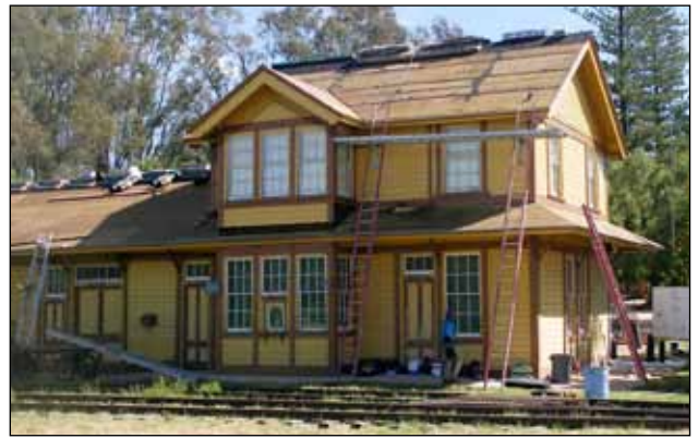
Above: New shingles wait in bundles on roof ridge, July 2012.

Goleta Depot now has a brand-new roof, thanks to the financial support of the City of Goleta and the Santa Barbara Foundation . The re-roofing project was long overdue. The last time the landmark building received a new roof was during the Goleta Depot Preservation Project, back in 1982.