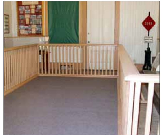
New barrier partitions the room into public and protected areas.

Remaining work to be done includes the addition of labels to interpret the room for visitors and reorganization of the room’s existing displays.