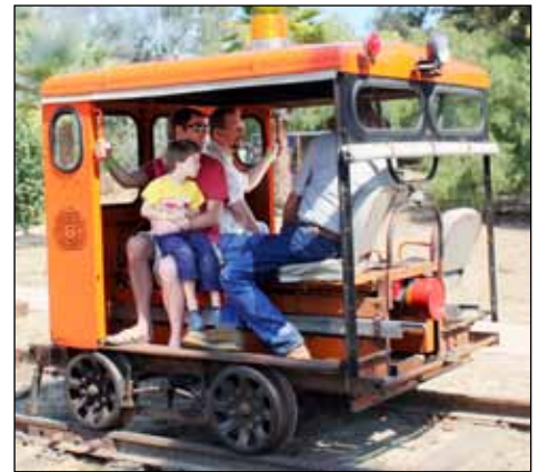
Speeder ride is a popular Depot Day attraction.

For just $3, you may buy a wristband good for unlimited trips on all rides. (Train &