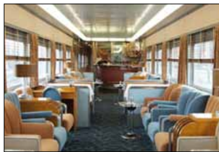
Interior of Overland Trail is always inviting.