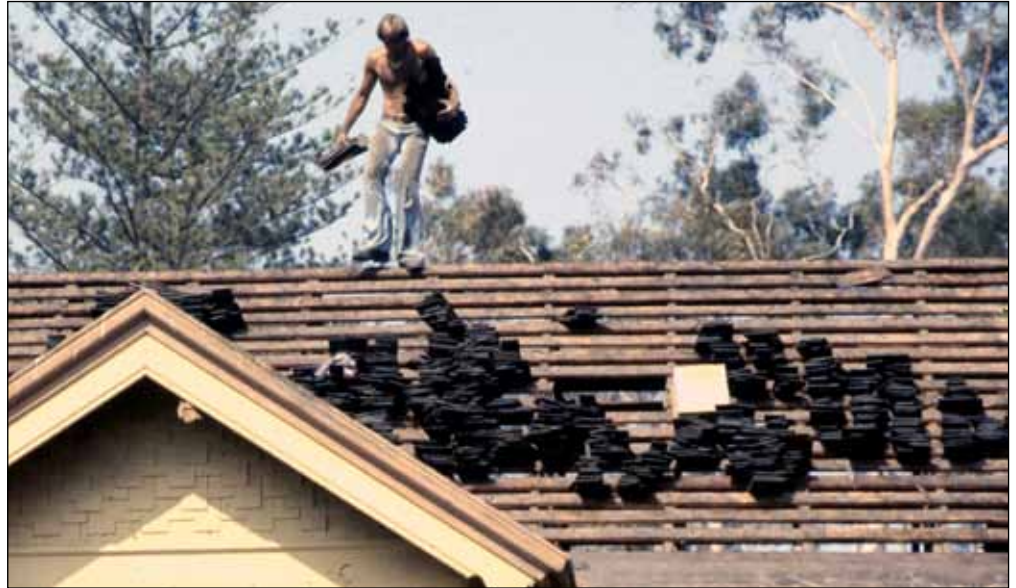
Below: Removing the original wood shingles, June 1982.