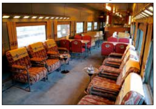
Acoma is the latest Central Coast Flyer addition.

you can enjoy the complete posting, usually including some great full-color images and other graphics.