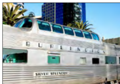
Views from Silver Splendor’s dome are unmatched.