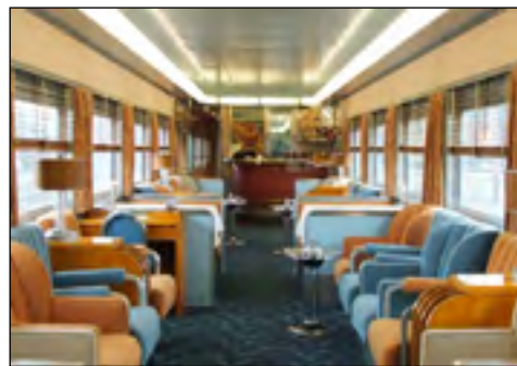
Overland Trail is the flagship of the Central Coast Flyer fleet of vintage railcars.

For more, see the Reservations & Information sidebar at the top-right.