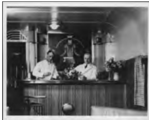
Acoma was part of the original 1937 streamlined Super Chief trainset